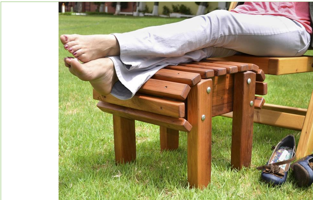
L-R: Flat Ottoman

Kick back and relax with either our Standard Ottoman or Flat Ottoman. The Flat Ottoman can also be used as a side table! We can build it in any size you need, just contact us .