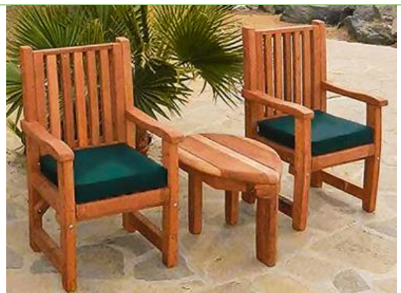
Ruth Armchairs with Cushions

The most popular fabric choice over the years is the Forest Green. For this reason, we've made it our default fabric choice for all cushions. If you'd like a cushion in a color or pattern other than Forest Green, you can choose from thousands of fabrics by visiting our Sunbrella fabric partner Trivantage Upholstery Fabric at: https://www.trivantage.com/fabric-upholstery .