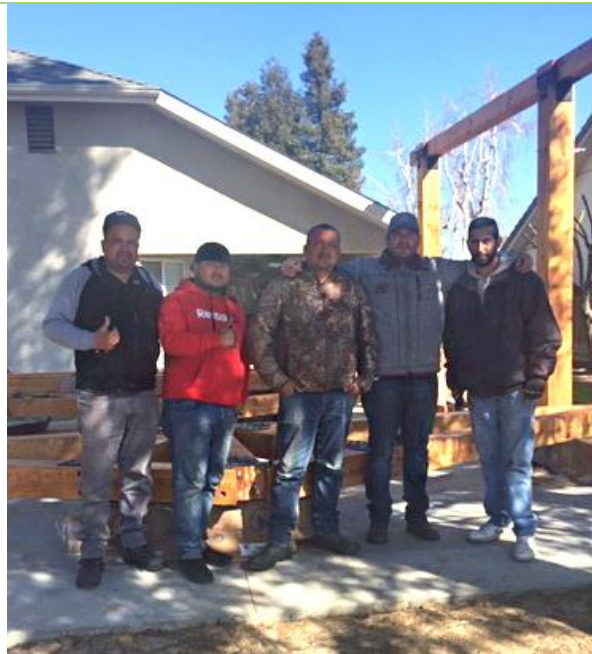
Some of the ugly guys from our install crew that will scare your children when they come install your order!