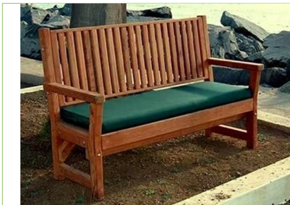
Massive Garden Bench with Cushion